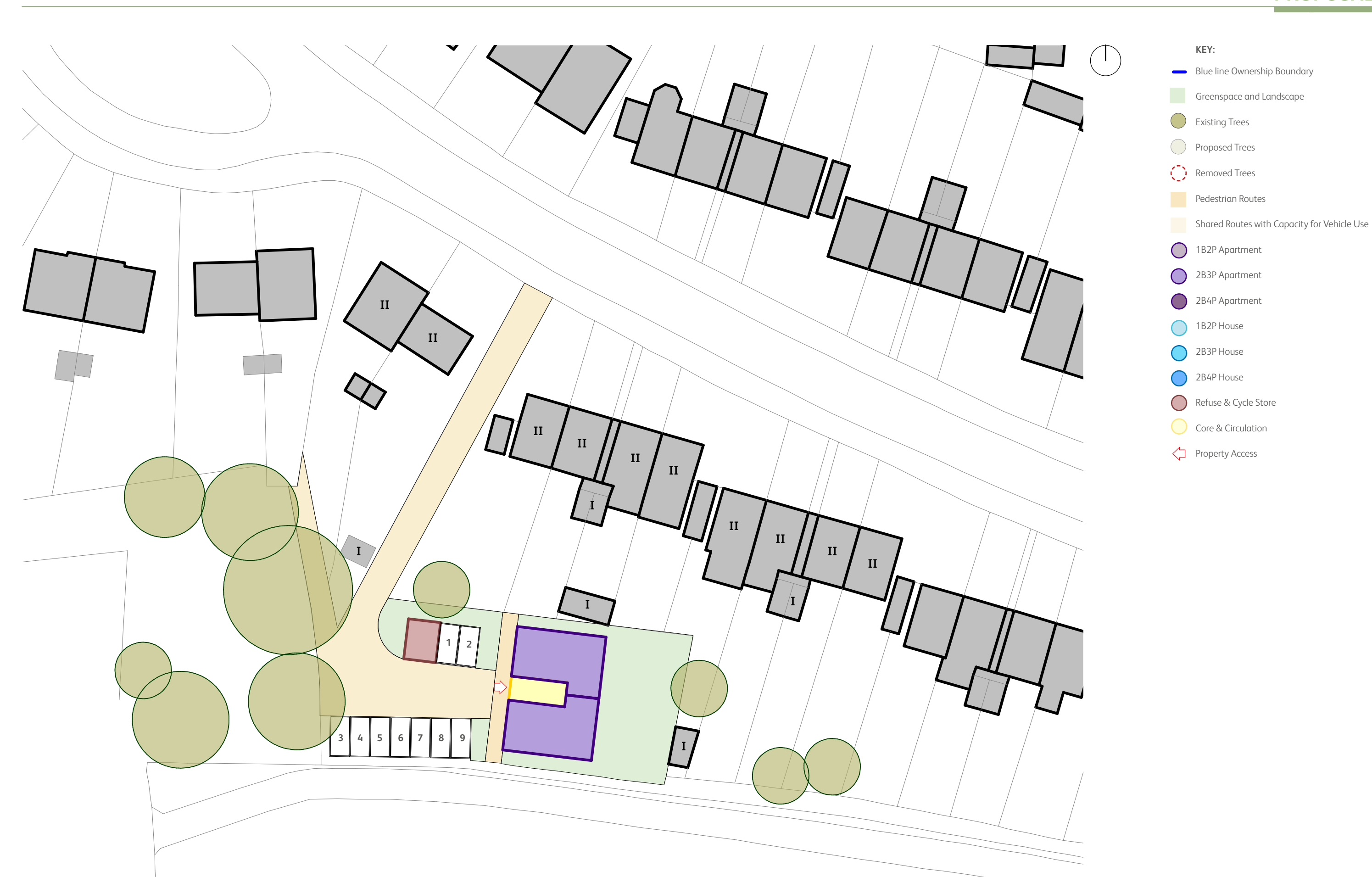
Figure 2 - Proposed Ground Floor Plan

Beechfield Wαlk | Capacity Study | June 2021